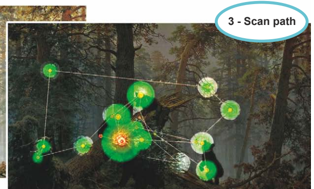
3 - Scan path