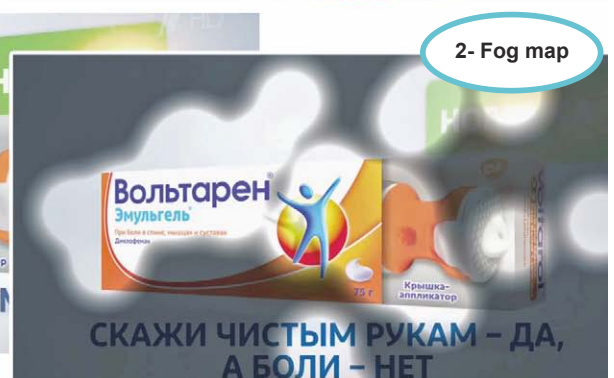
2 - Fog map