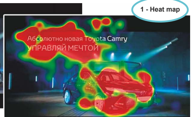
1 - Heat map